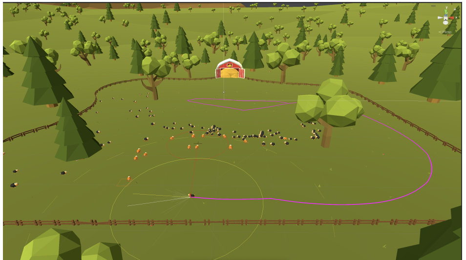
Figure 2. An example of our setup in Unity environment